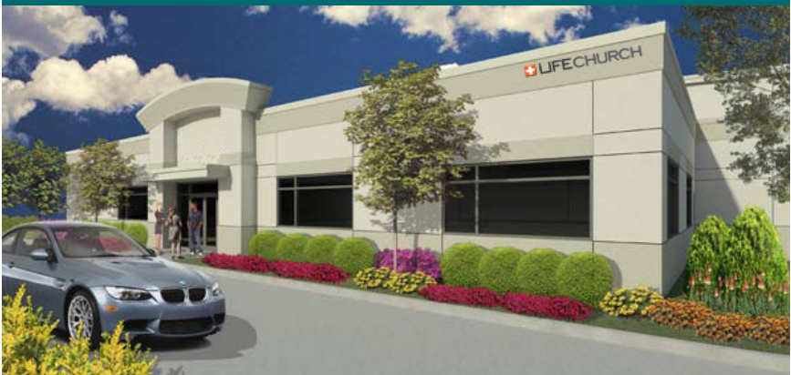
Artist's rendering of the new children's area*

Rest assured, our new campus is sufficient for all our current needs, as well as our future plan. As the "bow string" is released, it is for us to expand outwardly, in a multi-campus fashion, as shown to me in the 1980 "Ball of Fire" vision.